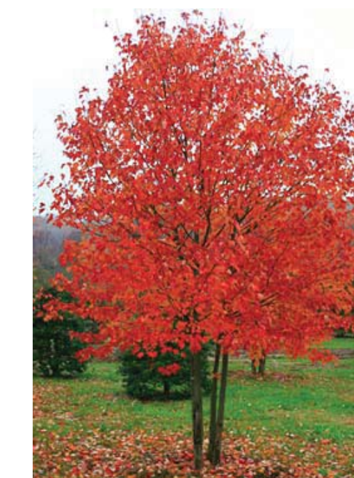
Acer Rubrum 'Red Sunset' - Red Sunset Maple