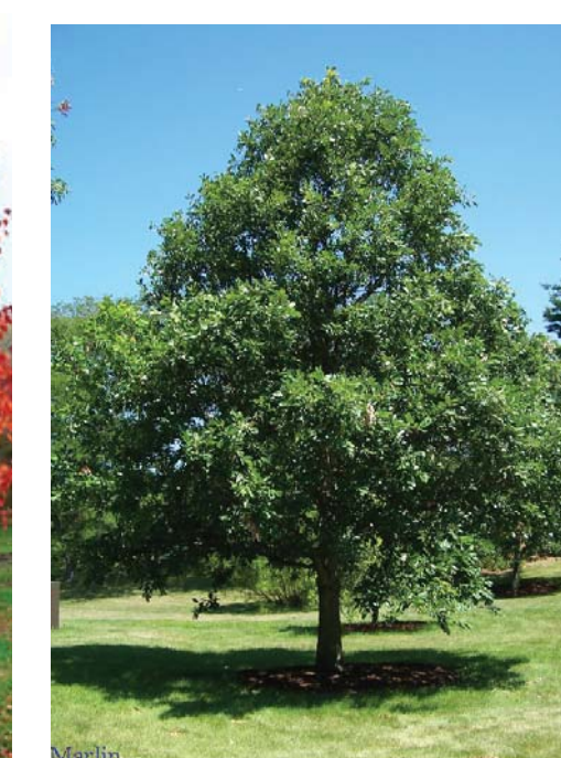
Quercus bicolor - Swamp White Oak