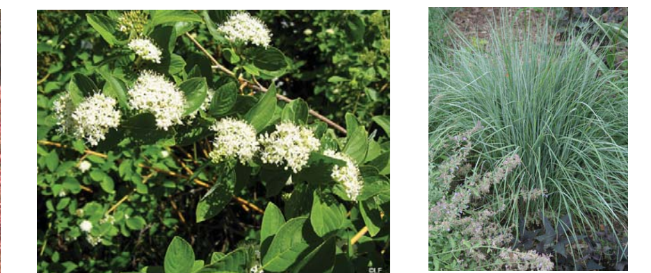
Left and above: Cornus sericea 'Kelsey' - Kelsey Dwarf Dogwood Above right and above: Schizachyrium scoparium 'The Blues' - Little Bluestem